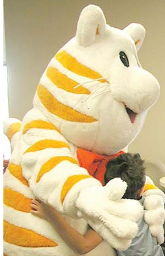
I got lots of hugs from the Wainwright kindergarten kids when they came to visit me!